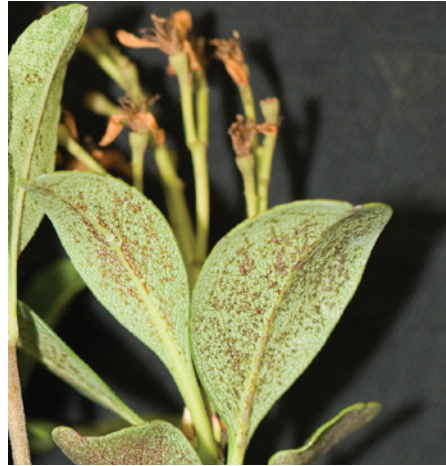
Indian Hawthorne landscape damage.

Plants with the symptoms described above should be examined for the presence of thrips. Leaves or buds from symptomatic plants should be collected and placed into a Ziploc bag to prevent the thrips from escaping. Label the bag with collection locality information, host plant, date collected and name of collector. Samples should be sent next-day delivery to an expert for identification